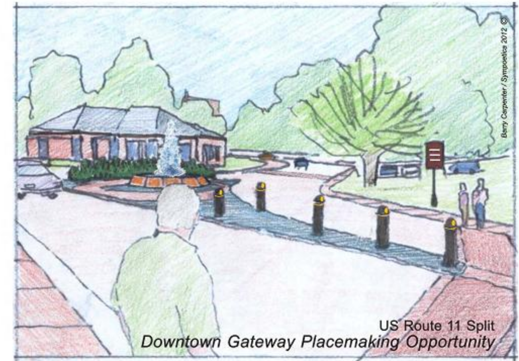
US Route 11 Split Downtown Gateway Placemaking Opportunity