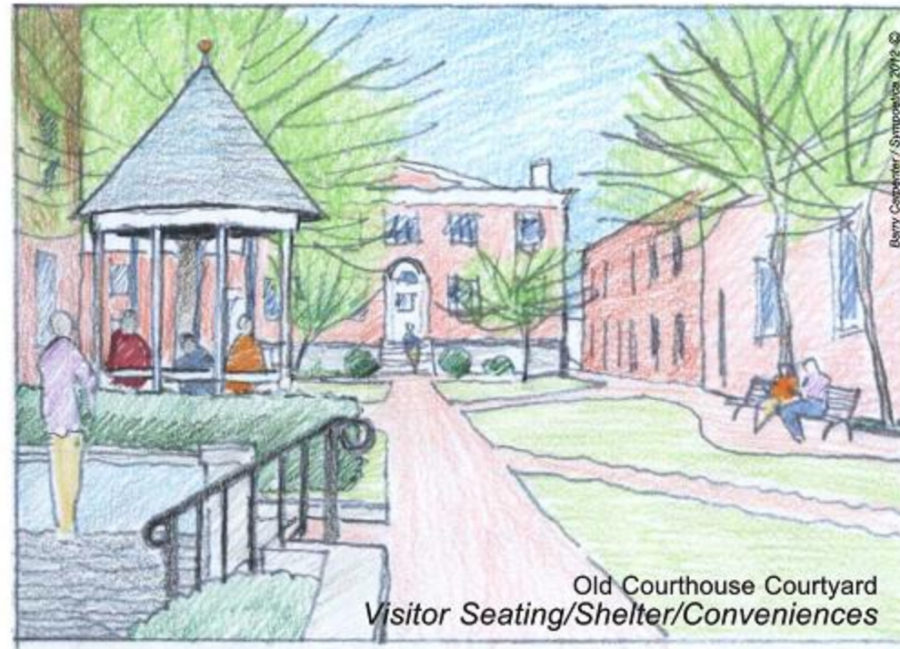
Old Courthouse Courtyard Visitor Seating/Shelter/Conveniences