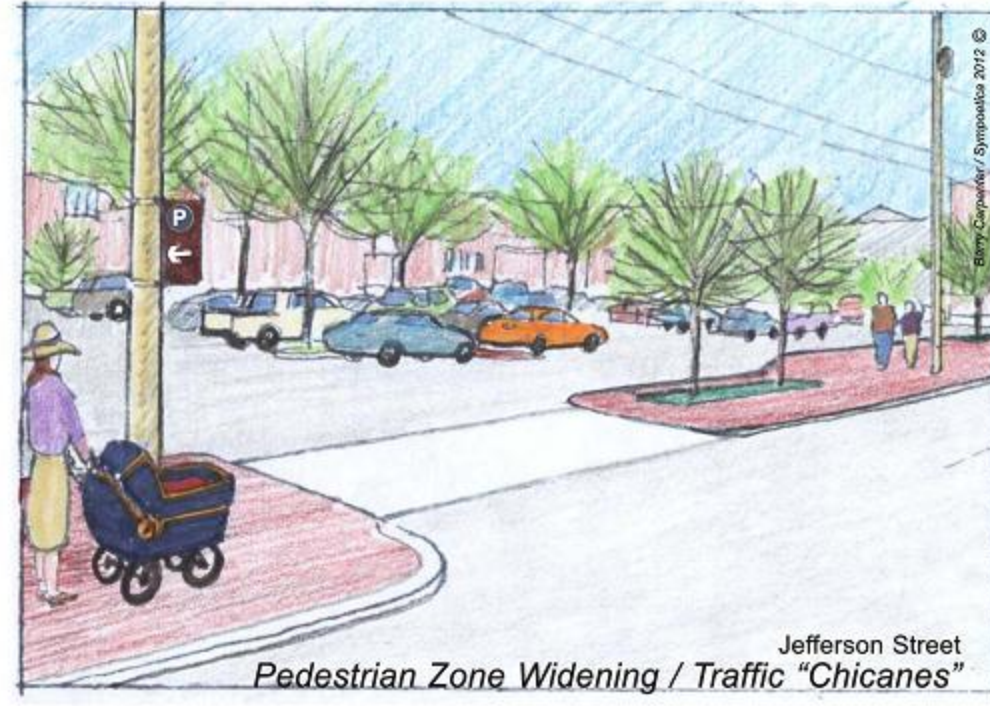
Jefferson Street Pedestrian Zone Widening / Traffic "Chicanes"