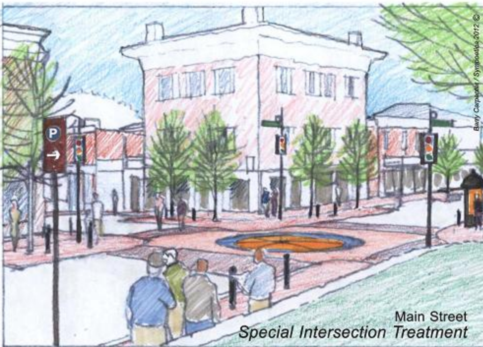
Main Street Special Intersection Treatment