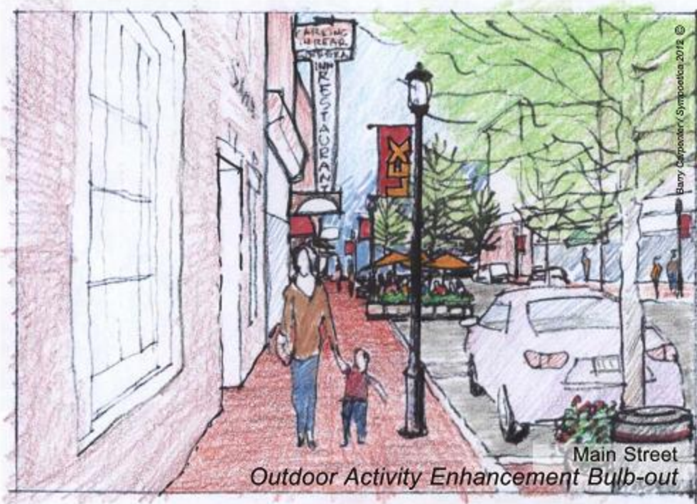
Main Street Outdoor Activity Enhancement Bulb-out