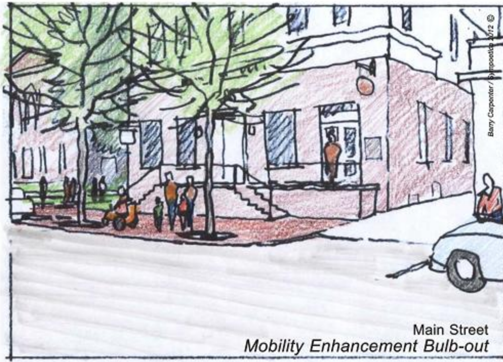
Main Street Mobility Enhancement Bulb-out