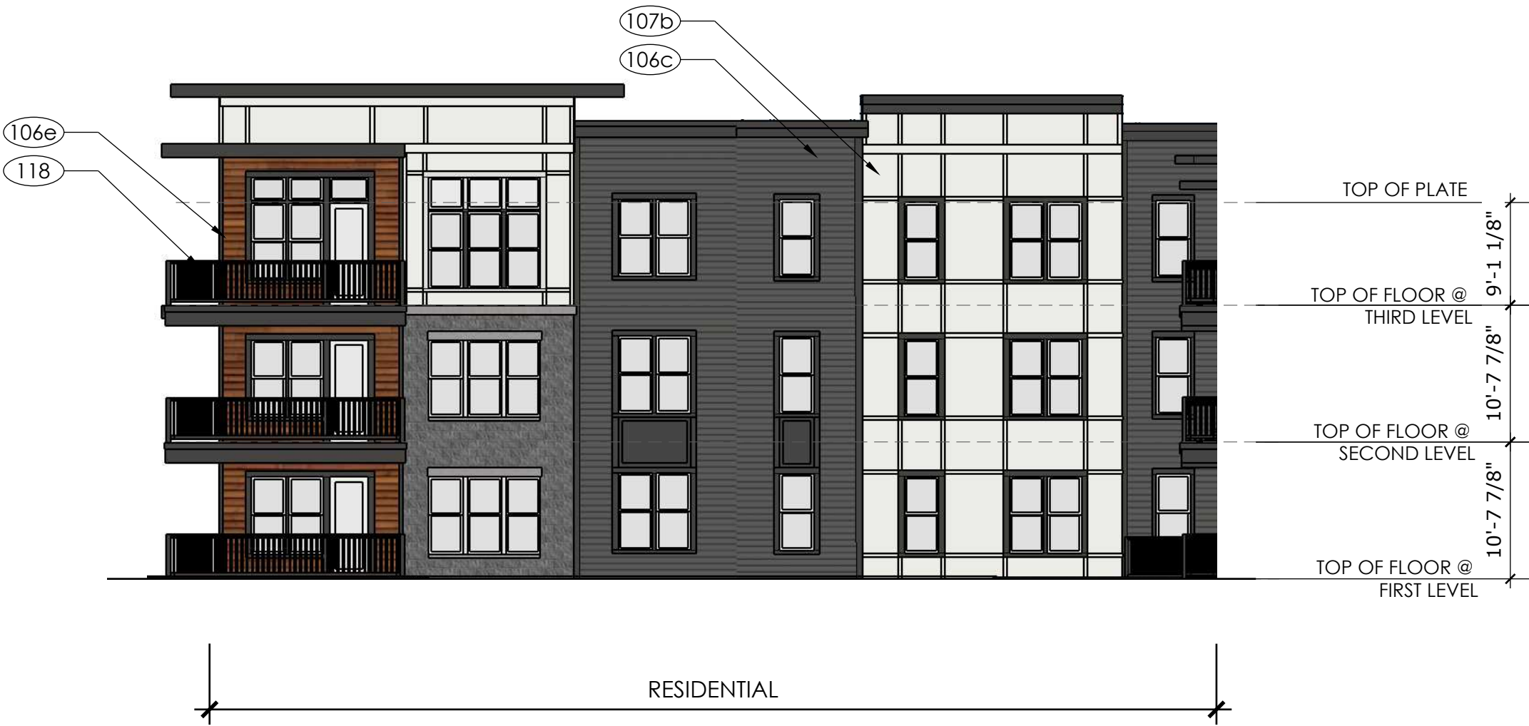
2 Parking Elevation