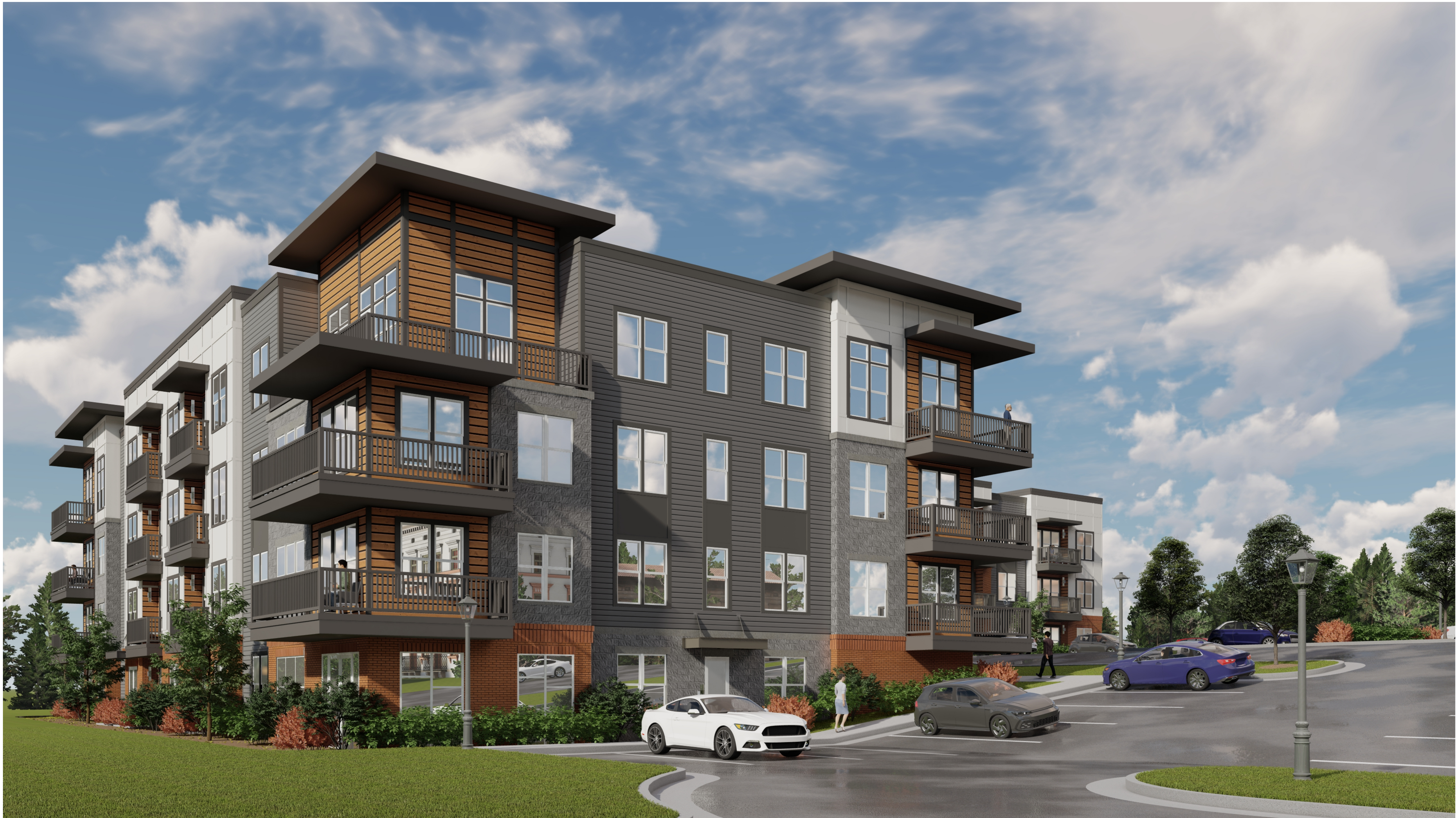
1 Perspective 1 NTS