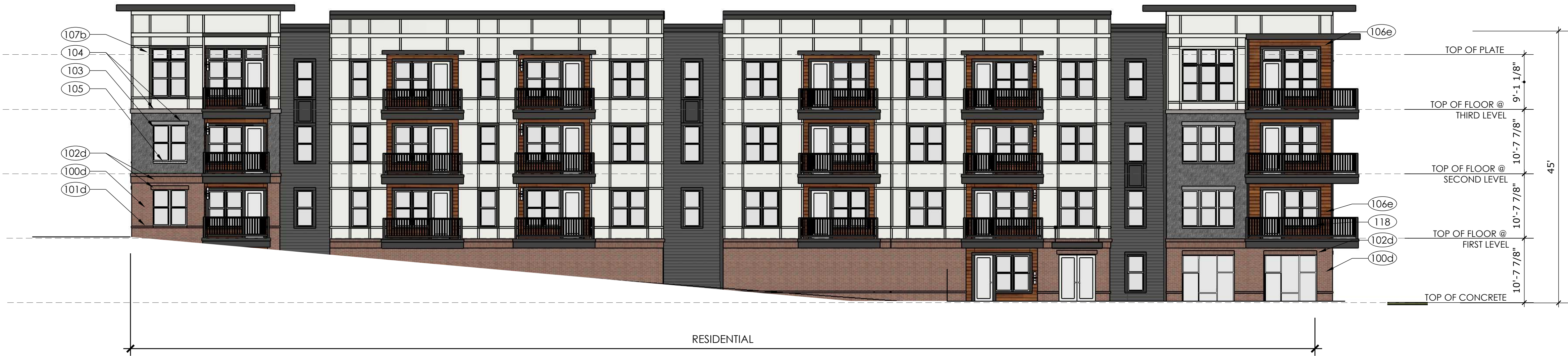
2 Side Elevation Scale: 3/32" = 1'-0" Elevation