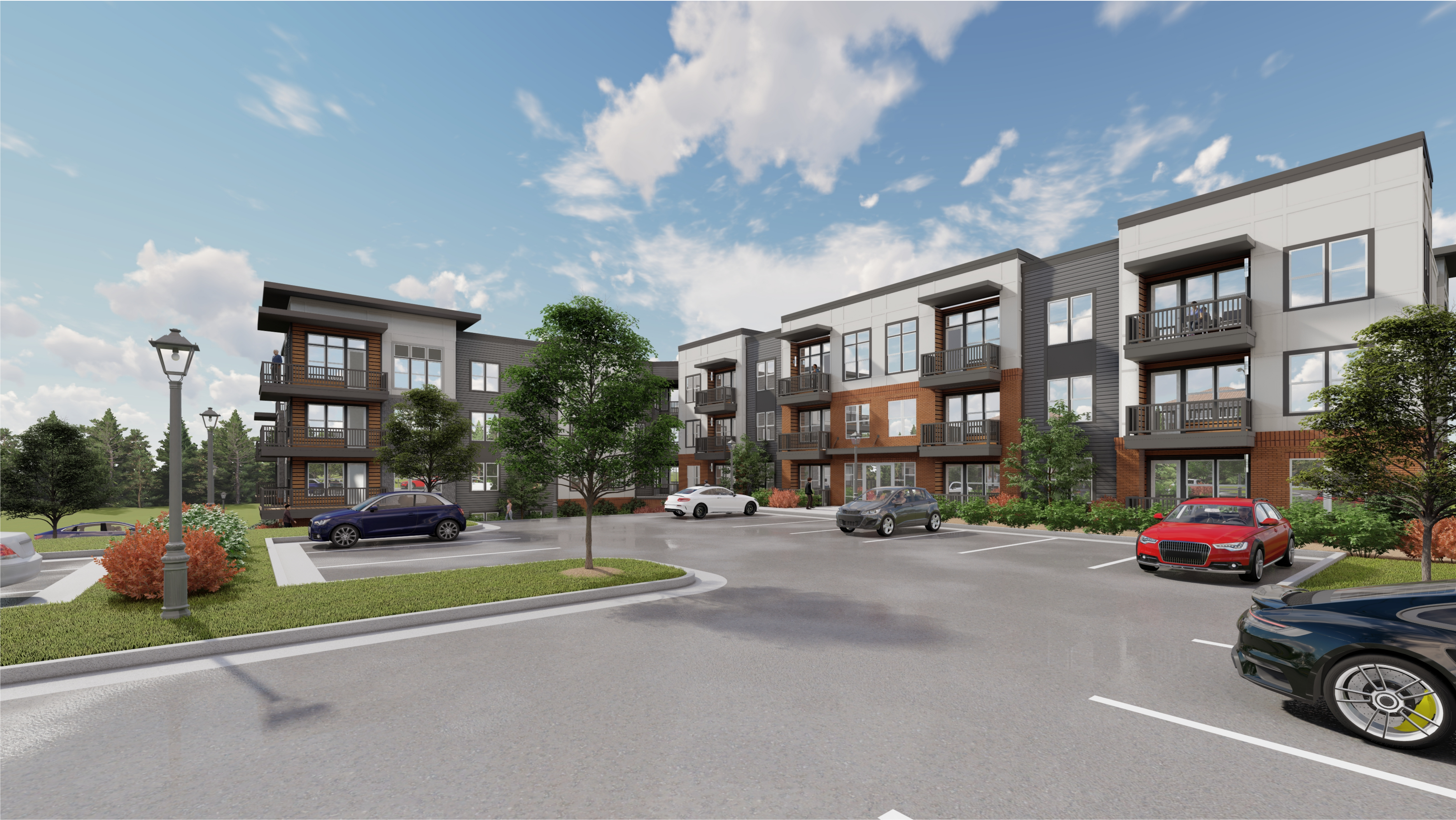
1 Perspective 3 NTS