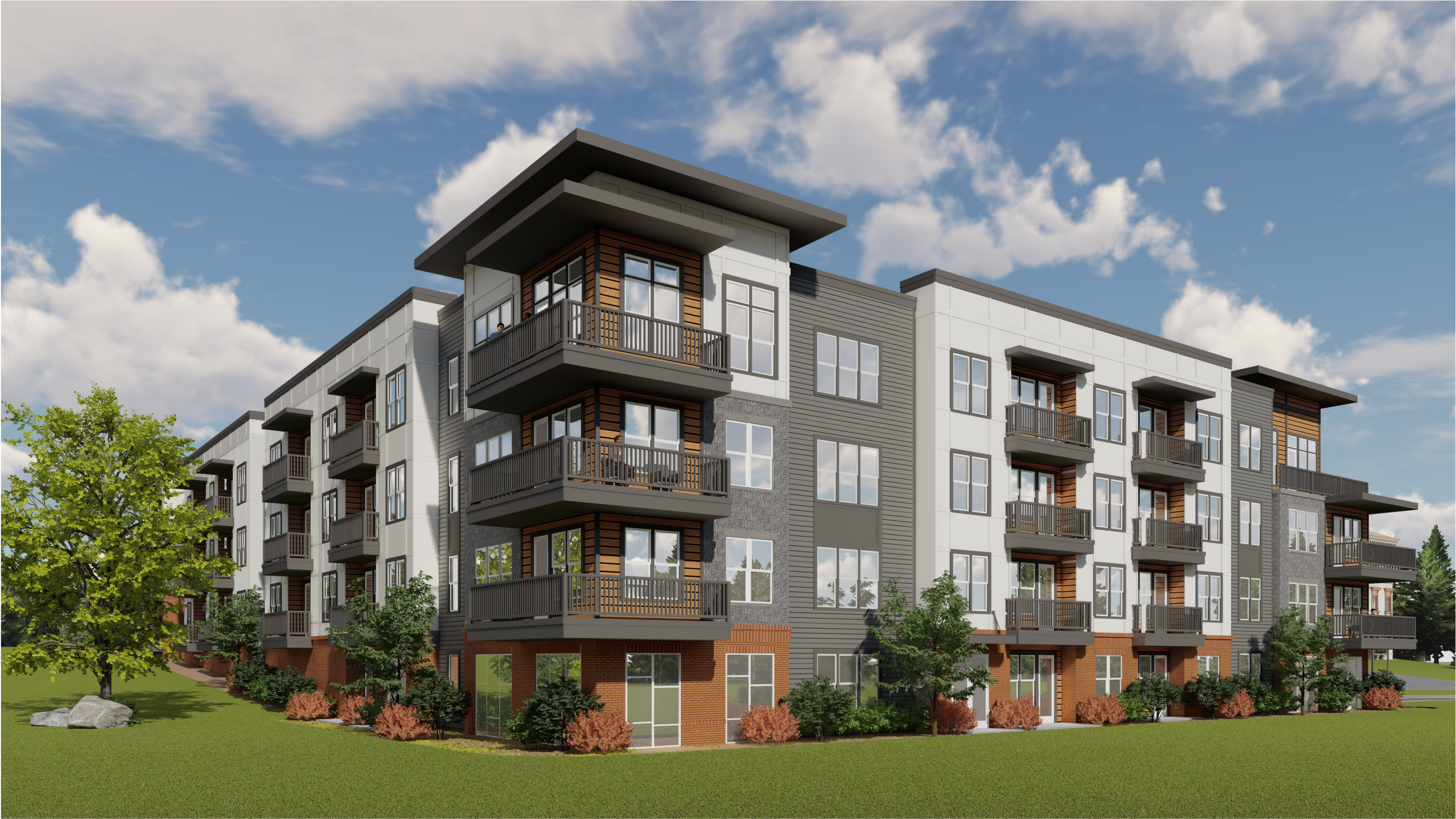
1 Perspective 2 NTS