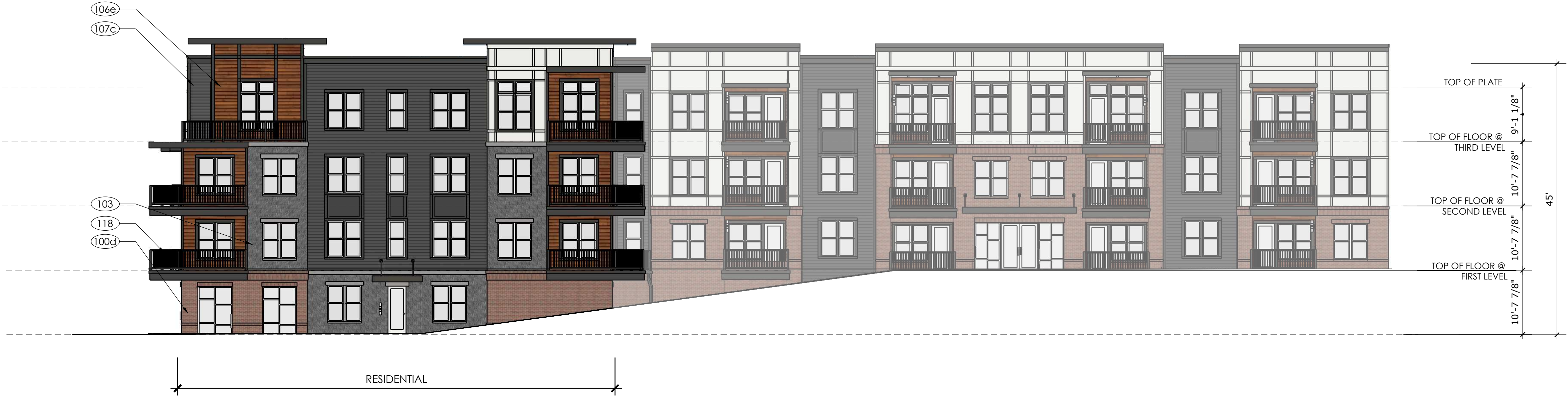
3 Parking (Entry Drive) Elevation