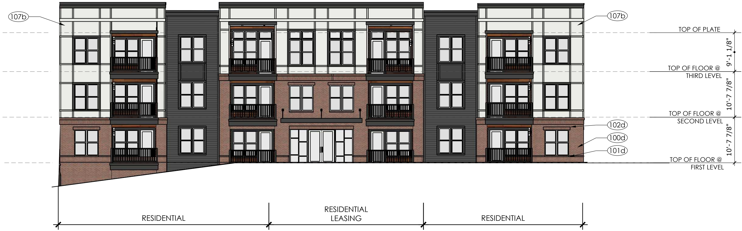
1 Parking Elevation