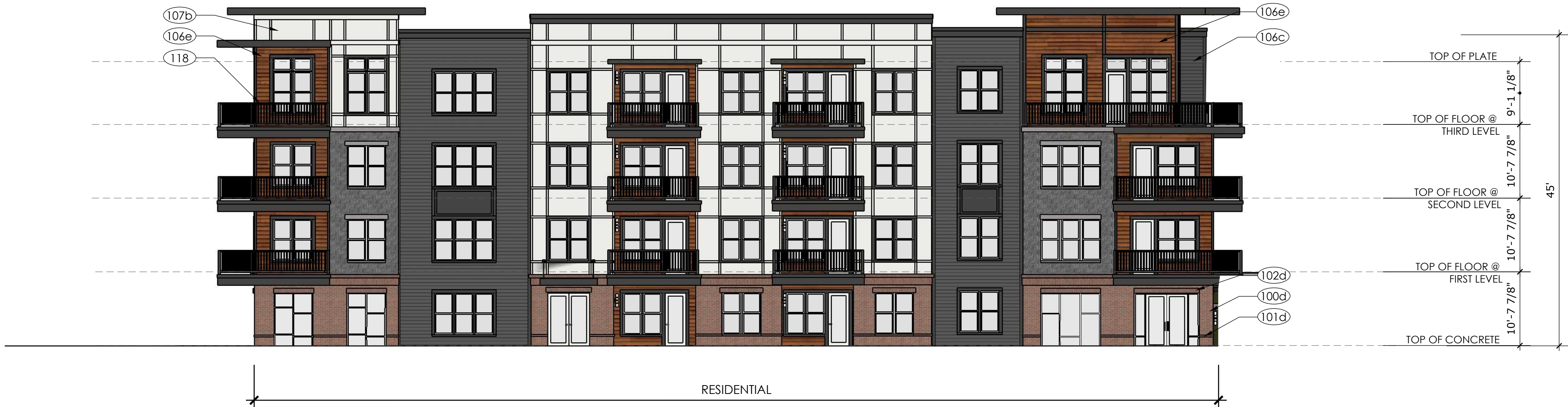
1 Spotswood Elevation Scale: 3/32" = 1'-0" Elevation